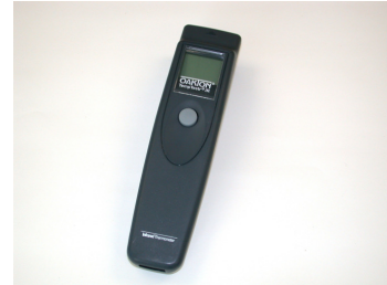
Diagram 5: Infrared Thermometer

Besides, they cannot accurately measure the temperature of metal surfaces and reflective foils.