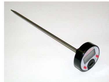
Diagram 4: Digital Food Thermometer