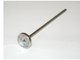
Diagram 2: Bi-metallic Stemmed Thermometer

Bi-metallic stemmed thermometers are the commonest type of food thermometers. These thermometers read the temperature from the tip and up the stem for 50 mm to 76 mm and the measured temperature is the average of the temperatures along the sensing area.