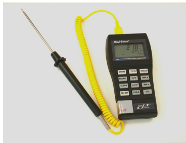
Diagram 3: Digital Food Thermometer

Thermocouple thermometers and thermistor thermometers measure temperatures through a sensor in the tip of the stem. They give readings quickly (within 10 seconds) and since the sensor is in the tip, these thermometers can measure temperatures in thin and thick foods conveniently. These thermometers may also be called “digital food thermometers” because measured temperatures are normally indicated on a digital display.