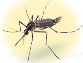
▲ Aedes albopictus

Mosquito bites not only cause itching or swelling but also transmit diseases. Aedes albopictus can transmit dengue fever and Zika virus infection. It breeds in small amount of stagnant water.