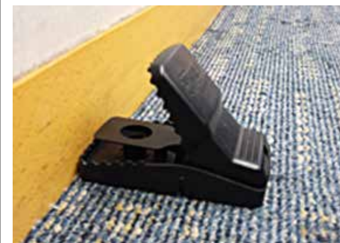
Figure 2. A sample of snap trap