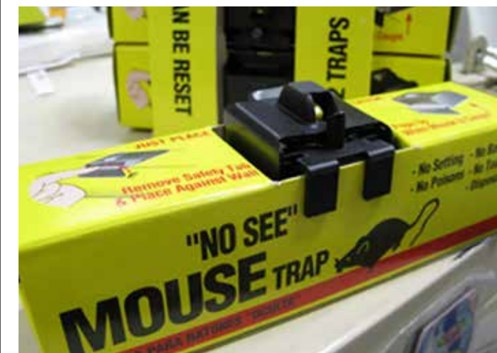
Figure 1. A new designed snap trap for mouse

In fact, there is a growing trend towards using non-toxic approach in rodent disinfestations. This is partly due to the public's preference for non-chemical pest management options and partly due to the fact that traps are the most cost-effective approach for the daily monitoring/control of minor rodent infestation which is needed by most commercial and residential clients.