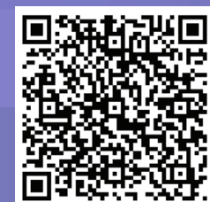
Composite Restricted Foods Permit (Online Sale of Restricted Foods)