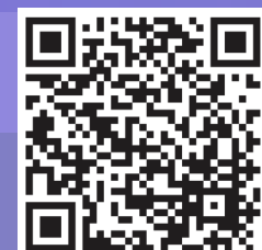
Composite Restricted Foods Permit