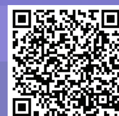
綜合受限制食物 售賣許可證 （網上售賣受限制食物）